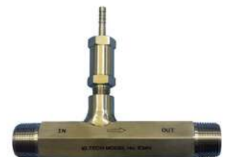
Venturi and NRV