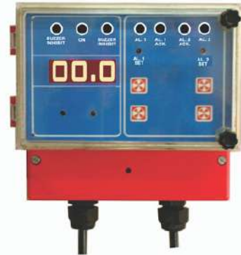
Ozone Air Monitor