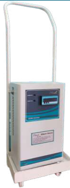
Trolley Ozone Generator