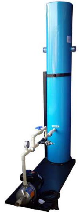
Ozone Mixing Tank