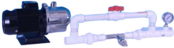
S.S Recirculation Pump & Venturi System