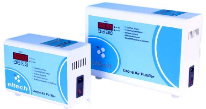
Ozone Air Sterilizer (AOZ SERIES)