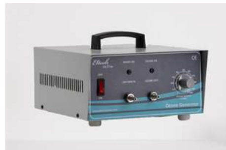
Medical Ozone Generator and Medical Accessories